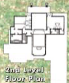
2nd Level Floor Plan

DONALD EOVIÑO (R), CRE, CRS, GRI 808-735-3066 • FAX: 808-735-1644