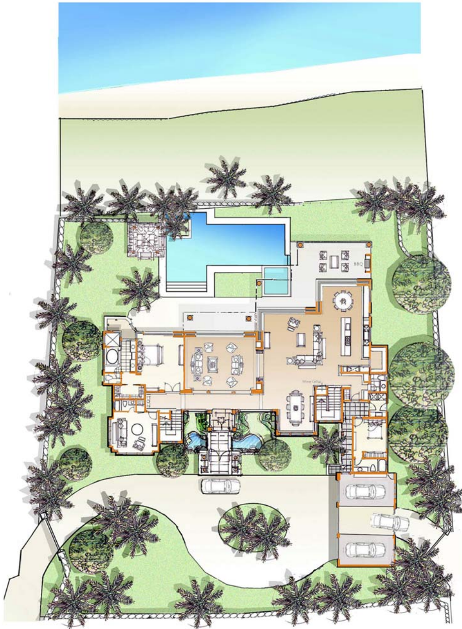
Portlock Beachfront - Entry Level Plan - Interior Area 4,665 SF

EL PORTLOCK BEACHFRONT PARTNERSHIP DEVELOPMENT MANAGEMENT: Donald T. Eovino