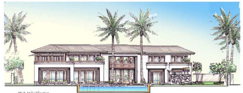
SK-II Maki Elevation